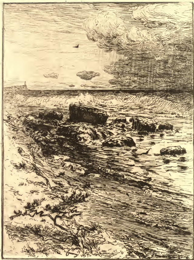
Along the Shore